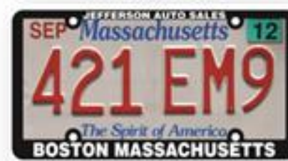
Plate Frames As Low As $ .59

Up to 2 Free Proofs Just Give Us A Call For Pricing