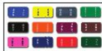
#308 (Full Set Jan-Dec)

• Quantity price breaks for Full Sets are: 1, 2, 4, 6, 10